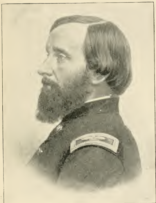
THOMAS WENTWORTH HIGGINSON COLONEL FIRST SOUTH CAROLINA VOLUNTEERS Afterwards 33d U. S. C. T.